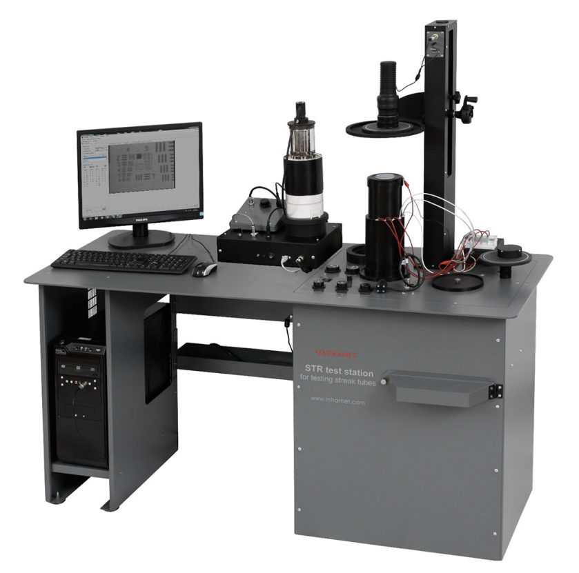
Fig. 1. Photo of STR test station