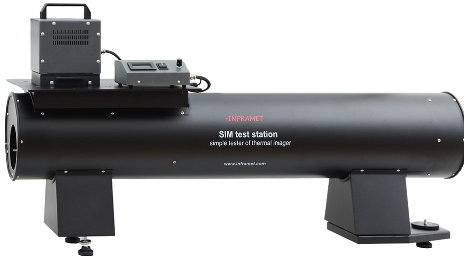
Fig. 1. Photo of SIM110 test system