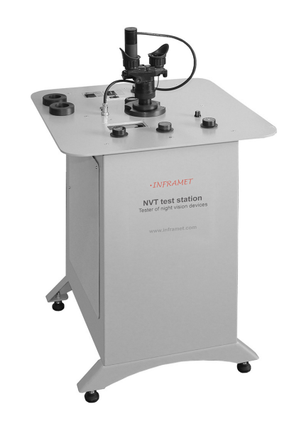
Fig. 1. NVT test station: a)block diagram, b)photo