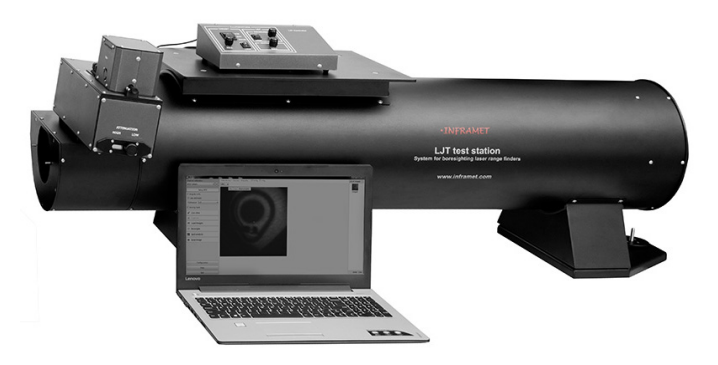
Fig. 1. Photo of LJT120 test station