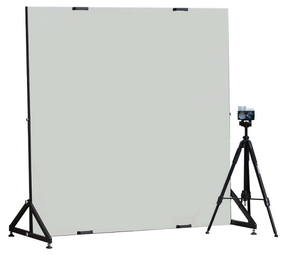
Fig. 1. Photo of the LAS test station