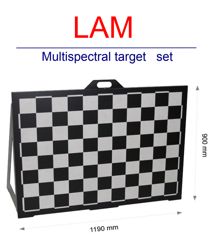
Fig. 1. Photo of LAM target