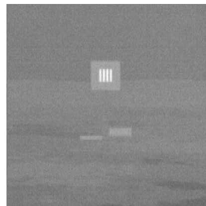
Fig.2. Image of the L A F T set generated by the tested imager during MRTD measurements