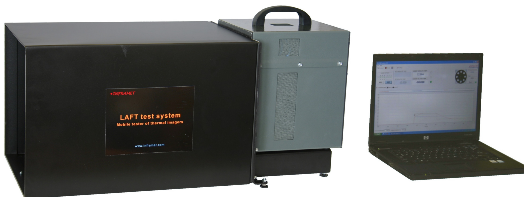
Fig. 1. Photo of the L A F T measuring set