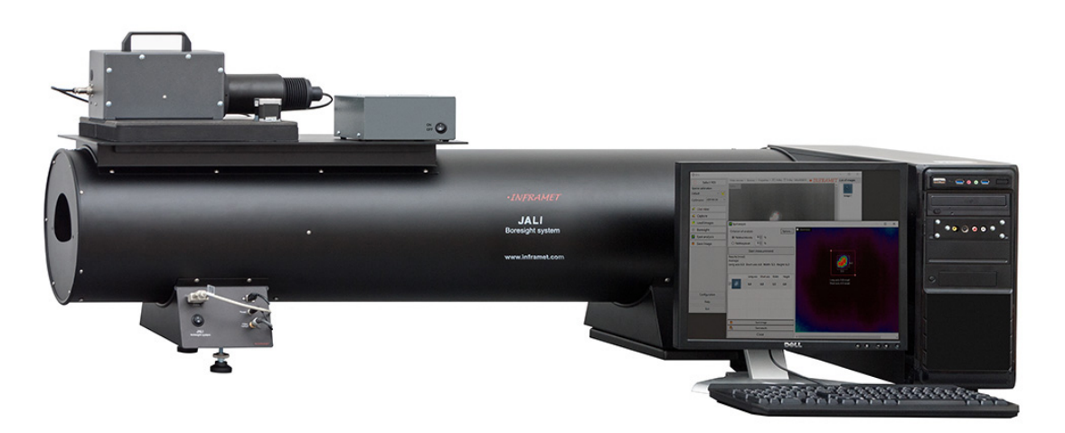
Fig. 1.Photo of the JALI boresight system