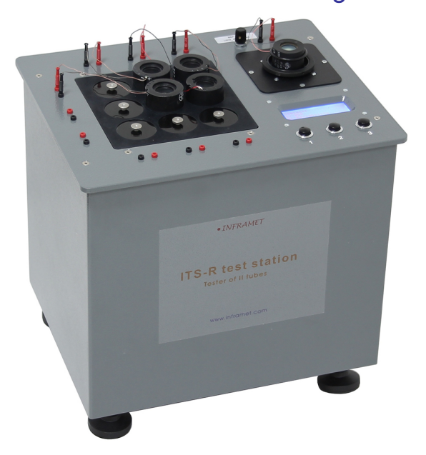
Fig. 1. Photo of the ITR test station