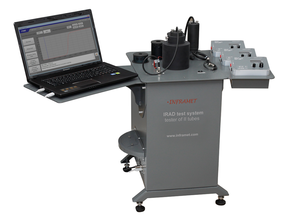
Fig. 1. Photo of IRAD test station

Station for measurement of radiometric/temporal parameters of II tubes