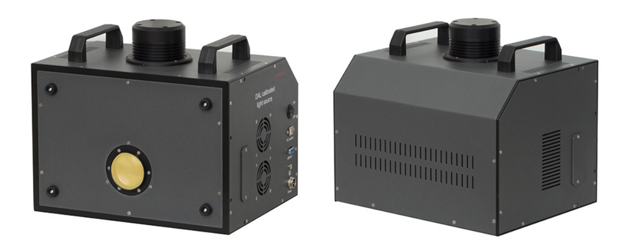
Fig. 2. Photos of DAL calibrated light source front view and back view