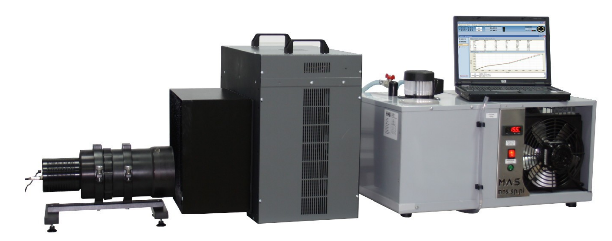
Fig.1. Photo of BLIQ-12D blackbody